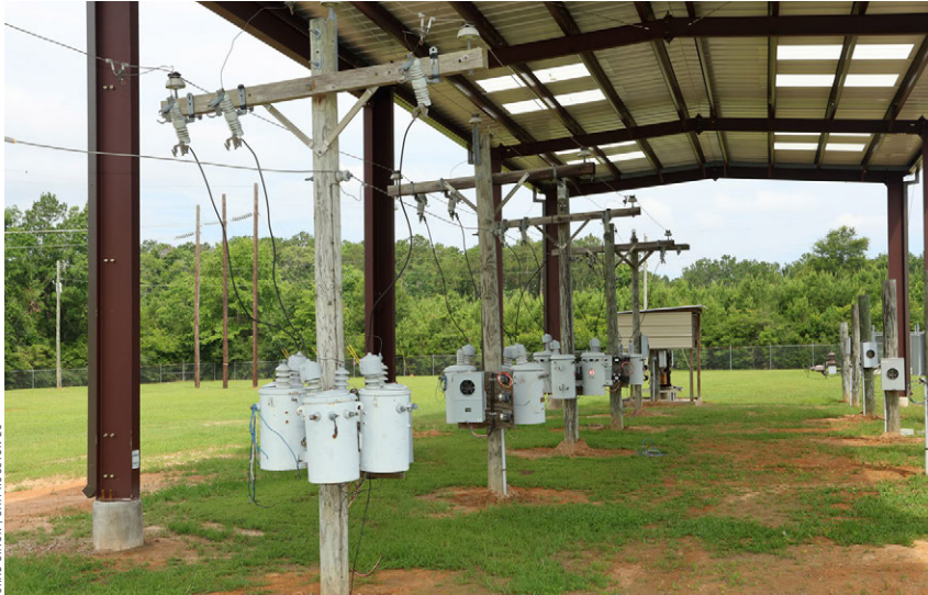
A roof protects transformer training from the elements in Livingston.