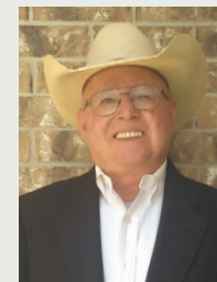
past 23 years before joining TEC.